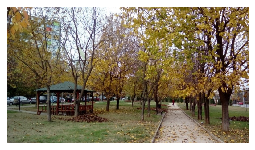
Figure 4. Allée with Morus alba and wooden gazebo for leisure and chess play, 2019. Slika 4. Aleja s Morus alba i drveni gazebo za odmor i igranje šaha, 2019 g.

The mean annual air temperature in the Skopje Valley is 12.4 °C, with a very pronounced annual flow of the air temperature ranging from 0.0 °C in January to 23.6 °C in July. The mean maximum air temperature is between 4.2 °C in the coldest month - January, and 30.6 °C in the warmest month - August. Specific is the variation of the temperature regime and rapid changes in the air temperature in a short period. Summer months have high temperatures - the average monthly temperatures are 20.7 °C in July and 20.2 °C in August. The absolute annual maximum temperature is very high, reaching up to 40.6 °C and the differences with the absolute annual minimum temperature of -25.7 °C are very high. Important for the selection of plants is the occurrence of spring and autumn frosts. The average spring frost date in Skopje occurs between 8<sup>th</sup> and 13<sup>th</sup> April. The average date of the first autumn frost occurs between 22<sup>nd</sup> and 26<sup>th</sup> October. The average length of the ice period is between 165 and 173 days.