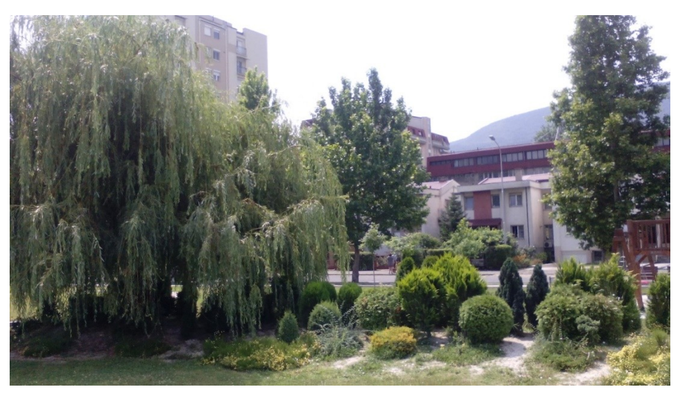
Figure 9. Small alpine-like garden, 2018. Slika 9. Mali (alpski) vrt, 2018 g.

Regarding the ecology of the recent species in the Park, for Betula pendula Roth species it is especially important to pay attention to the humidity, as the silver birch is sensitive to high temperatures and dry air (Džekov, 1988). This is very important for proper growth and development, and even for the survival of these trees, as birch is a light- and humidity-demanding species and thrives on full sun (Džekov, 1988). Several trees, during the data processing, were already withering (Figure 8, a). In addition, withering has been observed in some exemplars of ash, 'Jaspidea' in particular (Figure 8, b), and Thuja spp. (Figure 8, d).