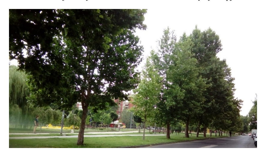
Figure 5. Single tree-lined avenue with Platanus × hispanica on Jurij Gagarin Str., 2018. Slika 5. Jednoredni drvored Platanus × hispanica u ulici "Jurija Gagarina" , 2018 g.