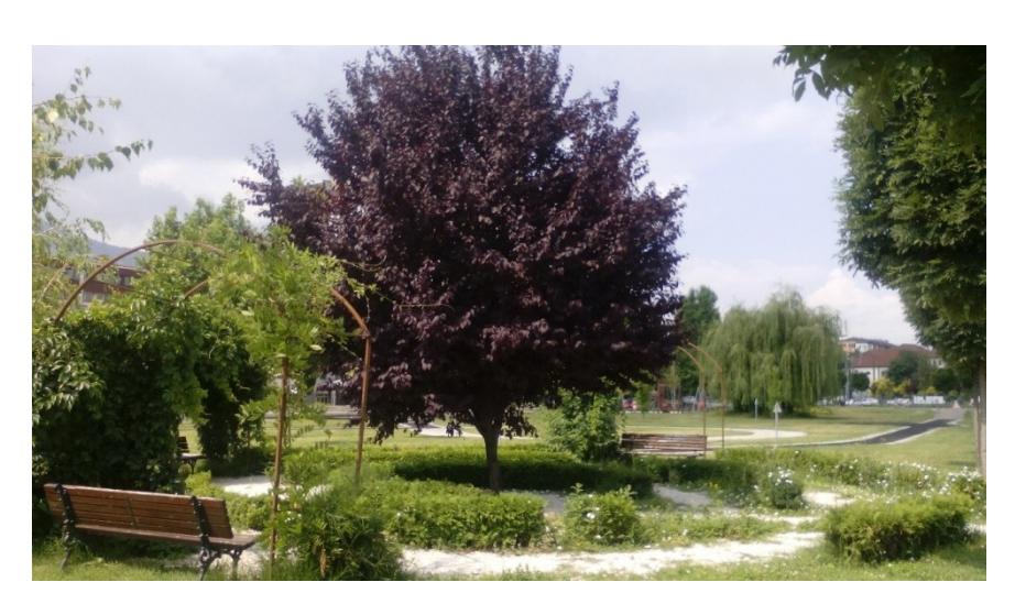
Figure 7. Square with Wisteria sinensis and Parthenocissus quinquefolia on pergolas, border hedges of Thuja occidentalis 'Globosa', and Prunus cerasifera 'Nigra' as focal point, 2018.

Likewise, 87 individuals (6.60 %) of 10 species (12.19 %) occur as line trees (Figure 5), solitary trees or in small groups as remnants of the greening in the past: Platanus × hispanica with 45 trees, Morus alba L. with 13 (Figure 4), Juglans regia L. (with 8), Celtis australis L. (3), Aesculus hippocastanum L. (1), Gleditsia triacanthos L. (1), Pinus nigra J.F.Arnold (1), and Ulmus minor Mill. (1), including 3 species used as a green core of a small sacral architecture: Cupressus sempervirens var. horizontalis (Mill.) Loudon (with 10 trees), Platycladus orientalis (L.) Franco (3), and Pinus nigra (1). It is interesting to note that the citizens of the immediate surroundings planted the white mulberry 'grove' near the wooden gazebo for chess play (Figure 4).