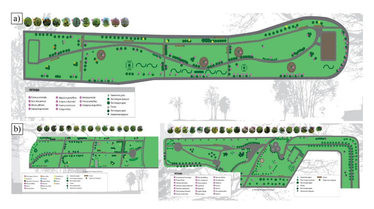
Figure 1. Landscape plan of the Macedonia Park designed by PE Parks and Greenery. Slika 1. Krajobrazno planiranje parka "Makedonija", dizajn JP "Parkovi i zelenilo".

The Macedonia Park is established in the municipality of Karposh in the Macedonian capital city of Skopje. This starts back in 2012 when first microlocation of the Park is designed (Figures 1,a and 2). To be more precise, the Park as a whole consists of three microlocations (parts). The first and the second part are territorial continuum divided by street (Figure 3), but the third microlocation is completely physically apart, and therefore it is not investigated.