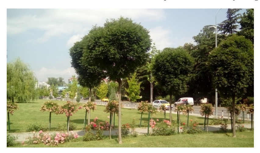
Figure 6. Fraxinus excelsior 'Globosa' with mini and tree roses of the Floribunda Group, 2018. Slika 6. Fraxinus excelsior 'Globosa' s patuljastim i ružama stablašicama hibridne grupe "Floribunda", 2018 g.