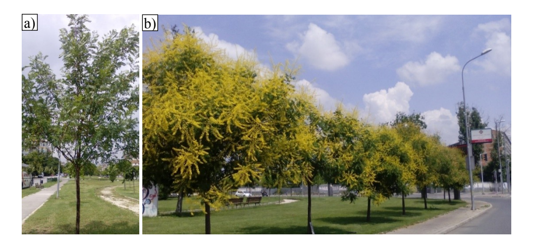
Figure 11. Individual of a) Robinia pseudoacacia and lined trees of b) Koelreuteria paniculata , 2018. Slika 11. Pojedinačno stablo a) Robinia pseudoacacia i drvored s b) Koelreuteria paniculata, 2018 g.

Eventually, it can be noted that only a small portion of the existing dendroflora in the investigated area, probably due to planting time, inadequate microclimate or quality of plant material, physiological weaken, and some species (may) decline. Thus, not only does the specimens lose its decorative value, but also it is necessary to constantly allocate resources for their proper care and maintenance (e.g. the Chusan palms lined trees of the past urban dendroflora) or to replace them again with the same species. Therefore, significant attention should be paid to the (future) proper selection of plants with suitable morphoecological characteristics with seasonal dynamics, and on adequate micro-locations (Simovski, 2011a,b,c,d).