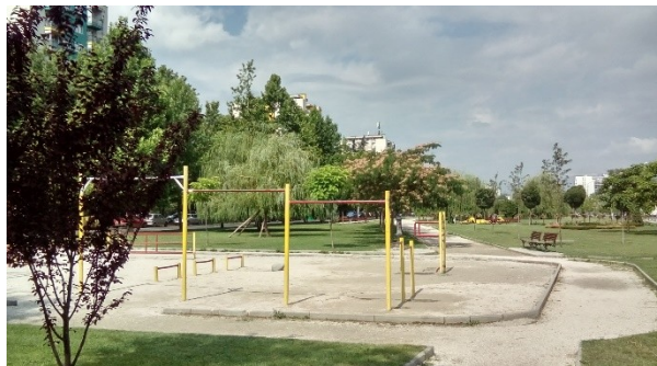
Figure 2. View of the Macedonia Park, 2018. Slika 2. Pogled na park "Makedonija", 2018 g.